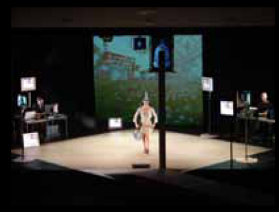
mech[a]OUTPUT, Koosil-ja/danceKUMIKO by Nanako Nakajima

Koosil-Ja/danceKUMIKO is developing Blocks of Continuality/Body, Image and Algorithm, exploring 3D realities between the body, technology and space using live processing and other technological devices.